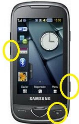
Picture 1. Download Mode.